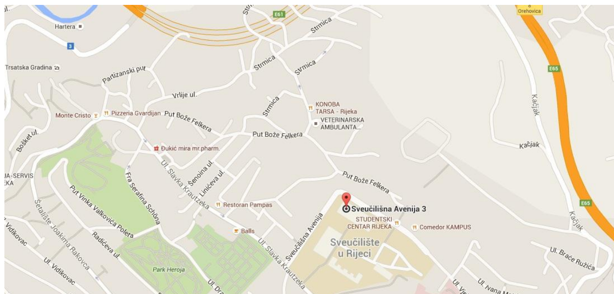
Slika 1 Lokacija kampusa Sveučilišta u Rijeci