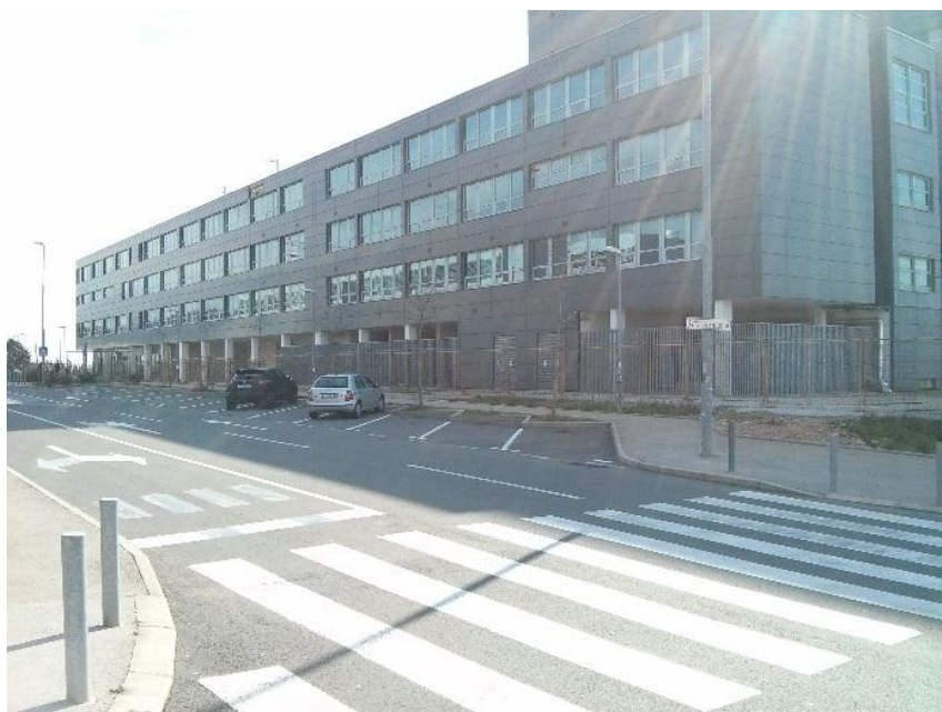
Slika 3 Zgrada sveučilišnih odjela

U nastavku slijede fotografije zgrade sveučilišta u kojoj će se održati događaj. Fotografije su ujedno i poveznica na Google Maps.