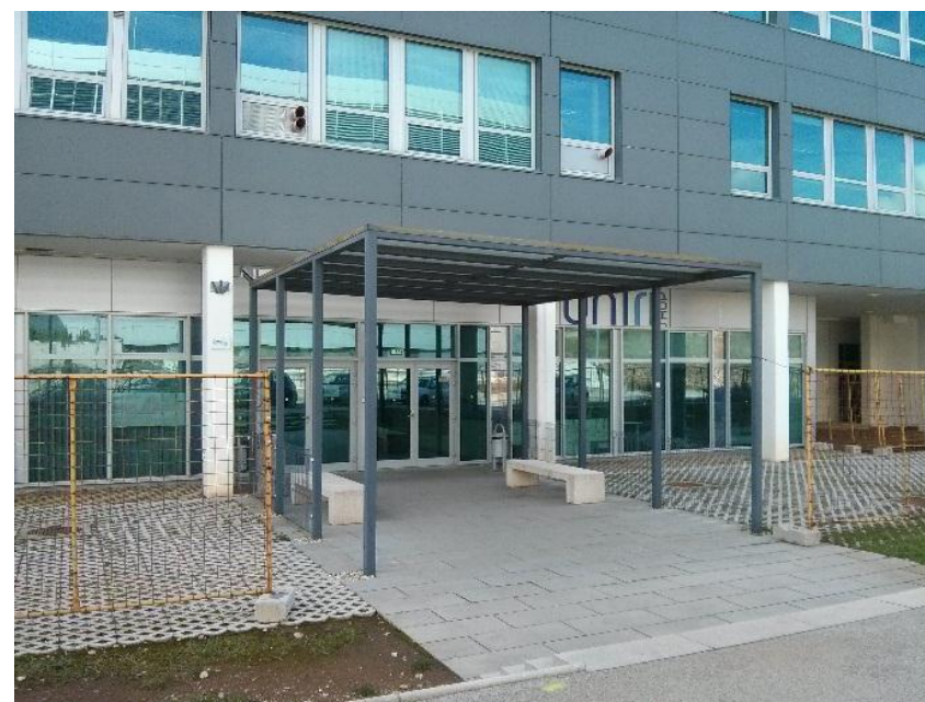
Slika 4 Ulaz u zgradu sveučilišnih odjela