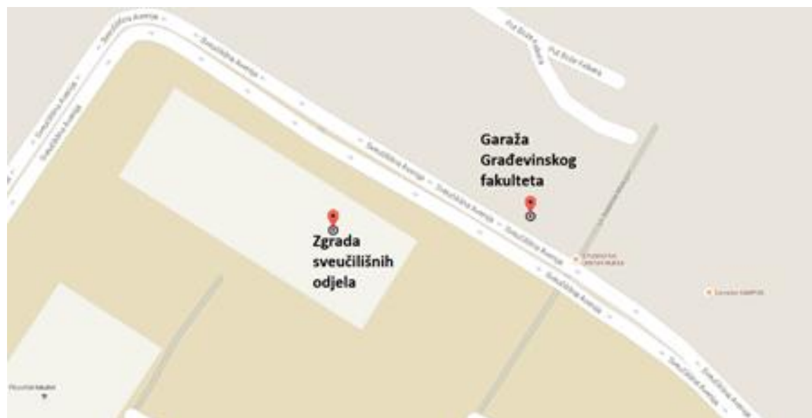
Slika 2 Smještaj garaže Građevinskog fakulteta

U slučaju da ne uspijete pronaći parkirališno mjesto u blizini zgrade sveučilišnih odjela, osigurati ćemo mjesto u garaži građevinskog fakulteta (nasuprot zgradi sveučilišnih odjela). U tom slučaju kontaktirajte nas na broj +385 95 9133395 kako bi vam omogućili ulazak u garažu.